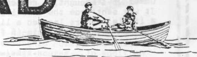
John Leavitt drawing showing push-pull rowing technique used by the two man crew of a Rhode Island hook boat